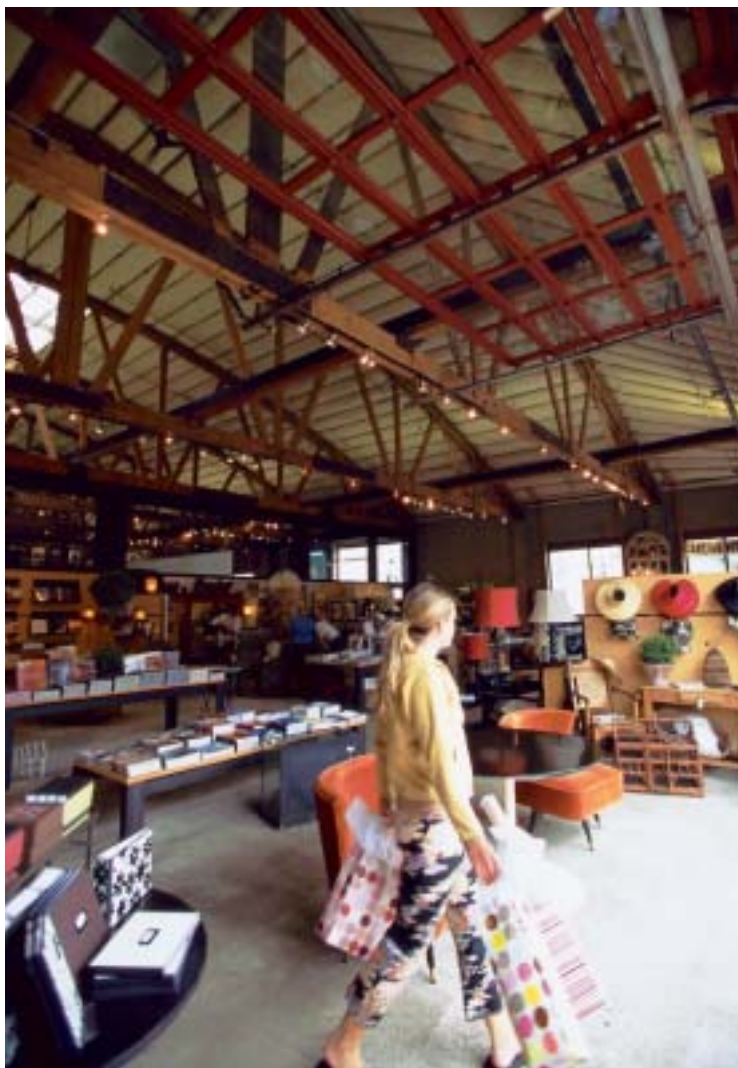
Solana Beach's Cedros Design District specializes in chic but casual shopping.

a vintage small-town feel with the eternal verities of the beach: a kind of Maui-meets-Main Street mien.